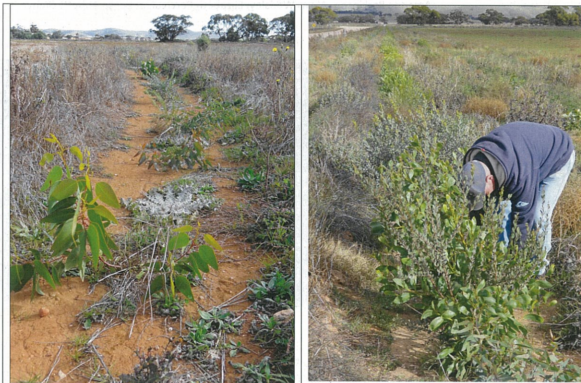
Eucalyptus and Acacia seedlings in the 2009 seeded rows (16-Jun-11)