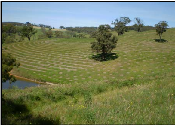
Looking west across the 2007 revegetation site. The brown circular patches indicate where hand direct seeding has taken place, the continuous lines is where the vehicle was able to seed the paddock. Photo taken on 11 November 2007

Direct Seeding undertaken over 6ha on 4 September 2007.