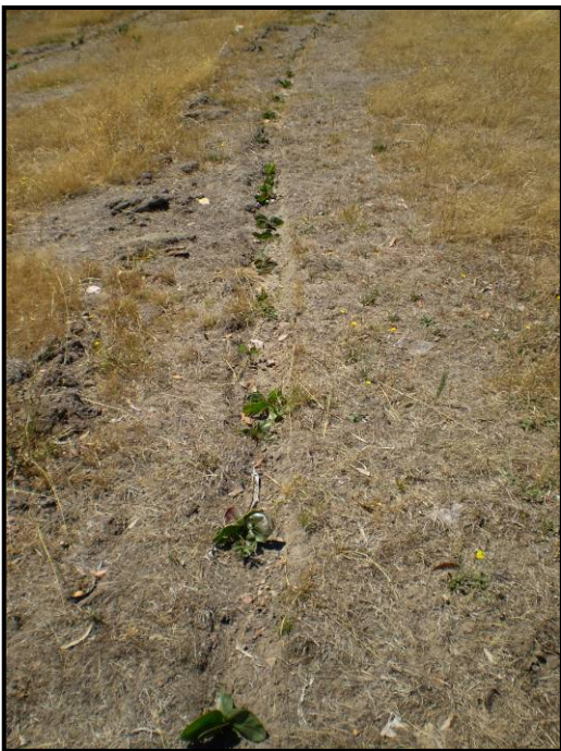
A well established row of seedlings. Photo taken on 5 th March 2008