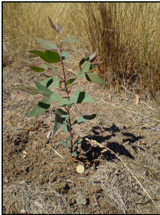
A well established Eucalyptus camaldulensis (River Red Gum) Photo taken on 5 th March 2008