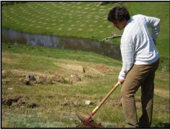
Preparing the soil for hand direct seeding. Photo taken on 11 th November 2007

Hand Seeding undertaken on 19 th September 2007