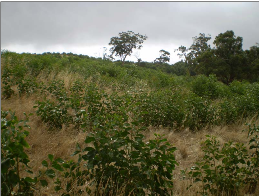
2007 revegetation area photographed Fe 4 th 2010