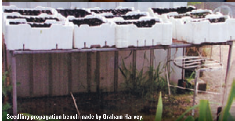
Seedling propagation bench made by Graham Harvey.