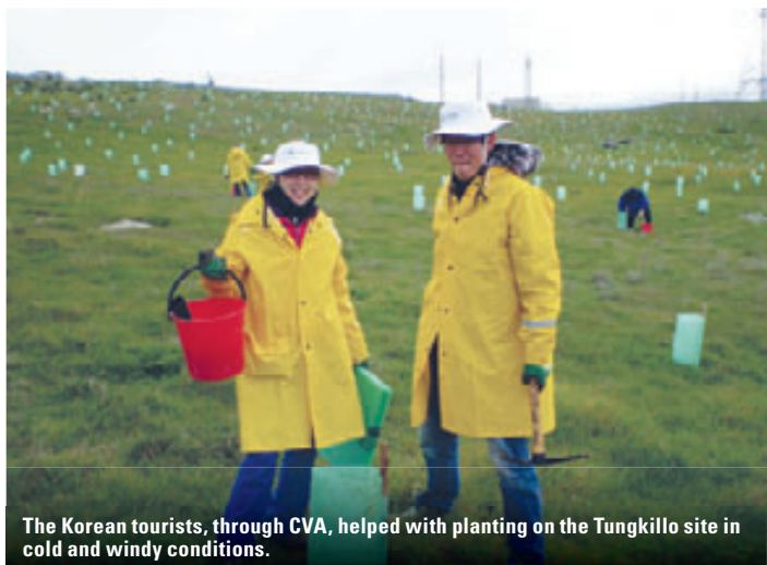
The Korean tourists, through CVA, helped with planting on the Tungkillo site in cold and windy conditions.

The plantings support a larger direct seeding project which will be undertaken next autumn to revegetate and increase the habitat value of the Tungkillo substation site. The planting site was quite rocky and inhospitable in some places and we purchased a hole digger to make the work easier. The digger will be available for hire by members next season. See the Autumn 2009 edition of ReLeaf for details.