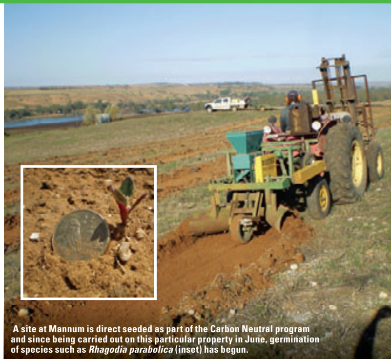
A site at Mannum is direct seeded as part of the Carbon Neutral program and since being carried out on this particular property in June, germination of species such as Rhagodia parabolica (inset) has begun.

If you are interested in finding out more, simply email us at info@treesforlife.org.au with the subject heading 'Carbon Scheme' and we will notify you of opportunities as details of the scheme evolve.