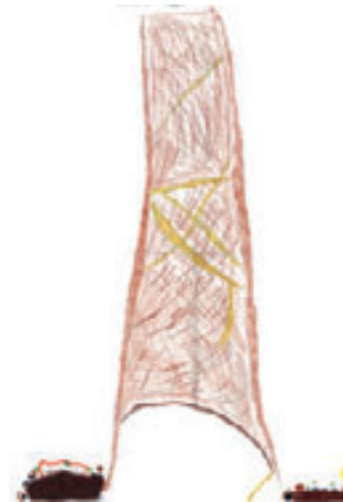
Bark of River Red Gum by Ella