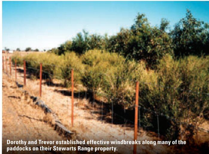
Dorothy and Trevor established effective windbreaks along many of the paddocks on their Stewarts Range property.

A year or so after the first shelter belt was established on the western side of the cattle yards, we obtained another batch of TFL seedlings to plant in the middle of one of the flat paddocks, so that the stock could shelter from cold