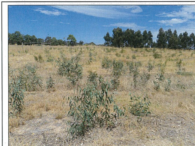
Native plants growing very well after exceptional rainfall in 2010